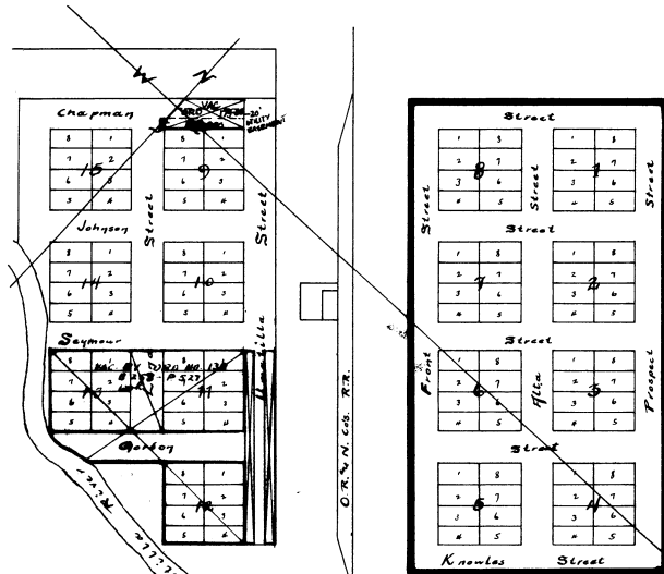
Plat of the Town of Foster.